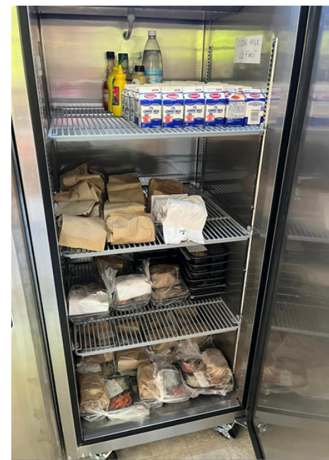
The award to Putney Community Cares helped them purchase a new fridge.

With the funding we established a community-led Steering Committee, who developed an RFP (Request for Proposals) based on the problem statement, and then selected organizations whose proposals aligned. Nine local organizations were selected out of a total of 15 applicants and a total of $168,000 was awarded through our "Community Resilience Grant". The awardees go as follows: